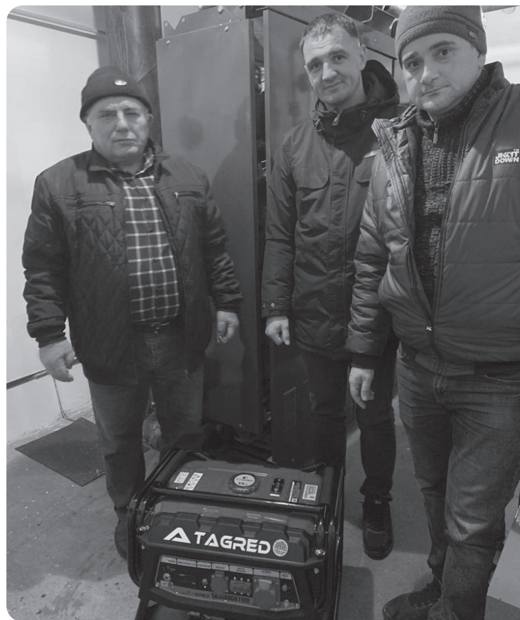
Pictured: Mayor of Korsun-Shevchenkivskii town with the generator received from the JAAS Foundation, which will be used by the town's kindergarten

For this reason, the JAAS Foundation successfully partnered with WFU to deliver five Tagred 5500W generators to Ukraine. The generators were transported from Poland to their final destination, where they were received by the organization Help to Children of War, which is an organization that distributes supplies free of charge to disadvantaged individuals and public heating and assistance units.